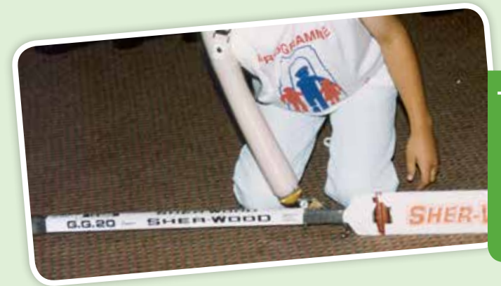
This above elbow amputee has an artificial arm that allows him to use a goalie stick. The wrist has flexion so he can get down on the ice with the stick.

Originally designed as an attachment for the inside of a baseball mitt, this device, by Hosmer Dorrance, proves valuable on ice, too! With it, this amputee can open and close his goalie glove to catch the puck.